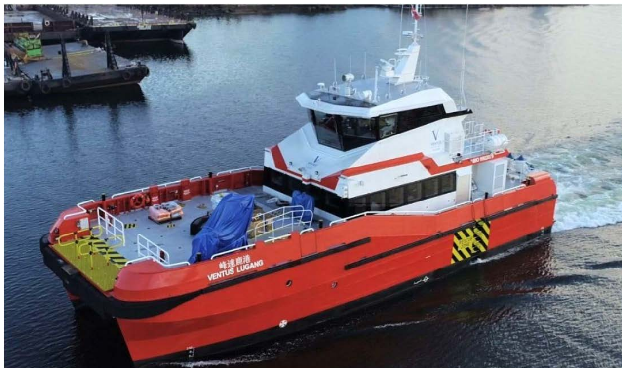
Figure 2-5 : Photo of Ventus Lugang