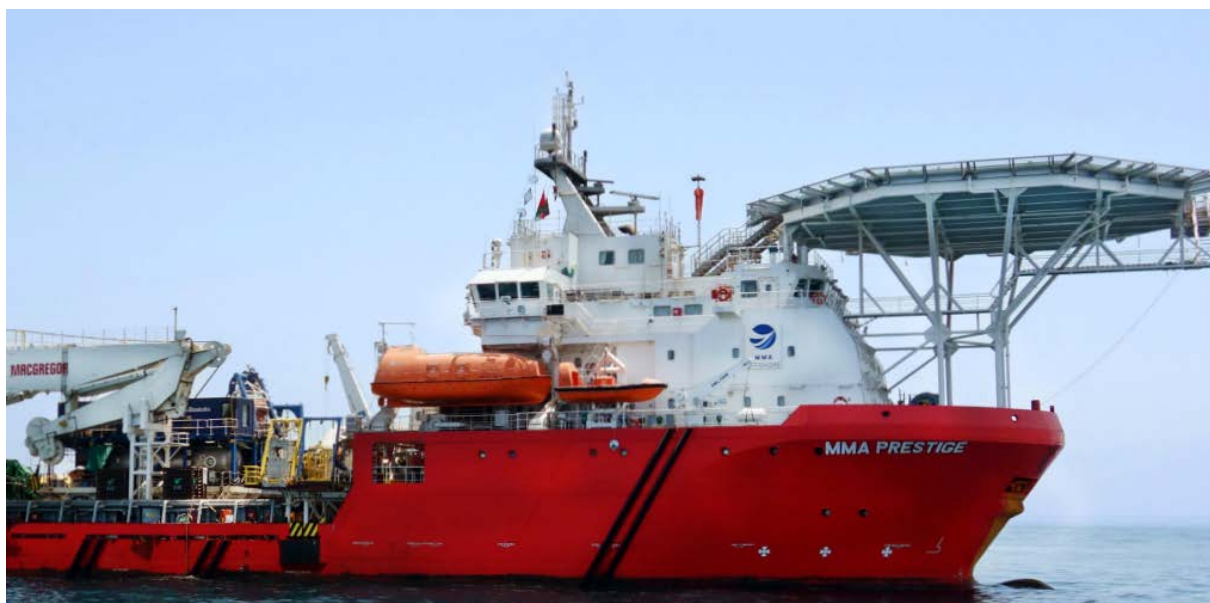
Figure 2-2 : Photo of MMA Prestige