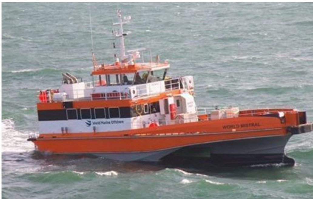
Figure 2-6 : Photo of UMO Mistral