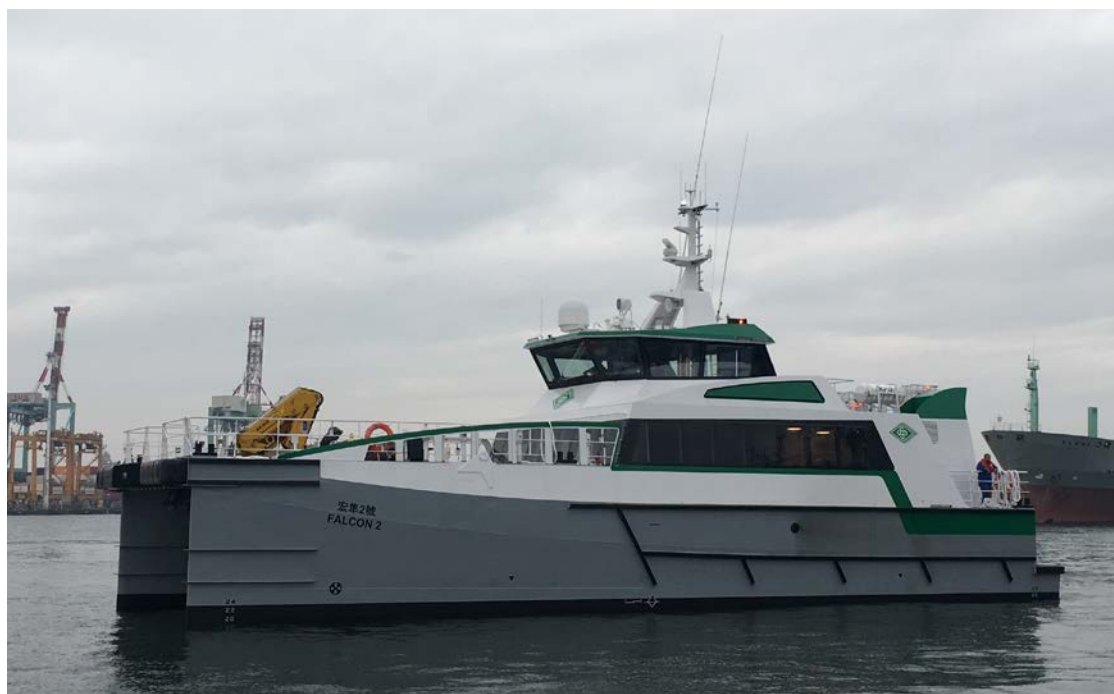
Figure 2-4 : Photo of Falcon 2