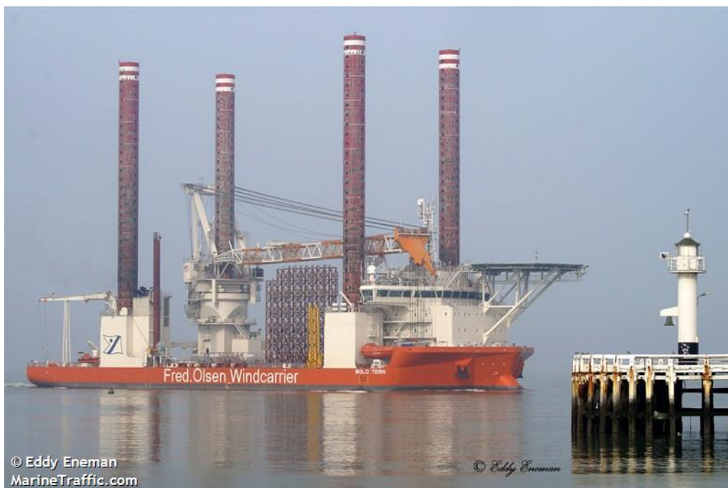
Figure 2-3 : Photo of <Bold Tern>