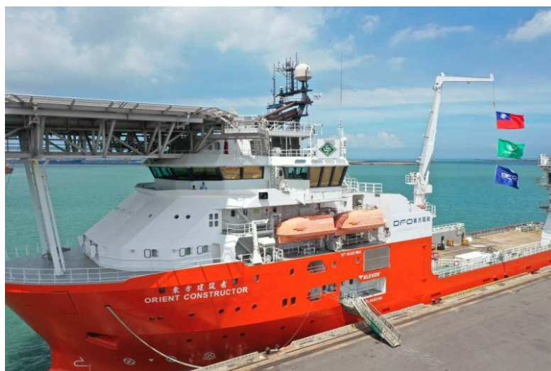
Figure 2-2 : Photo of Orient Constructor