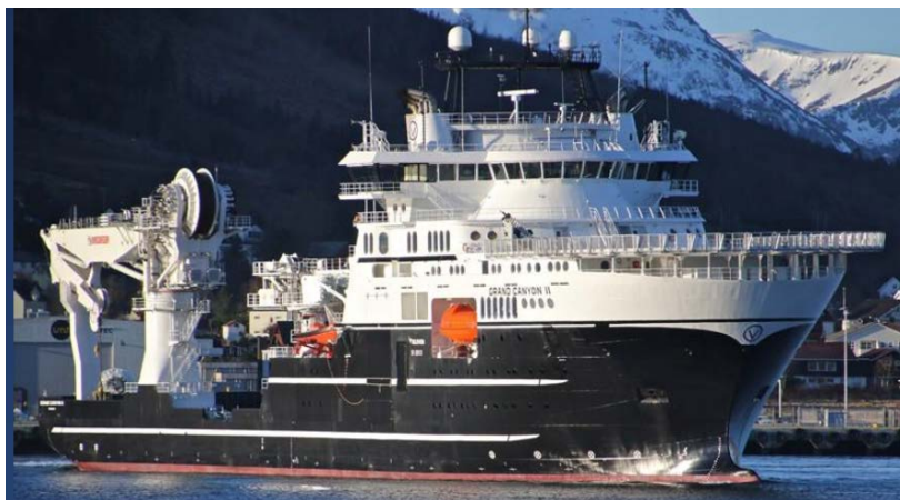
Figure 2-3 : Photo of Grand Canyon II