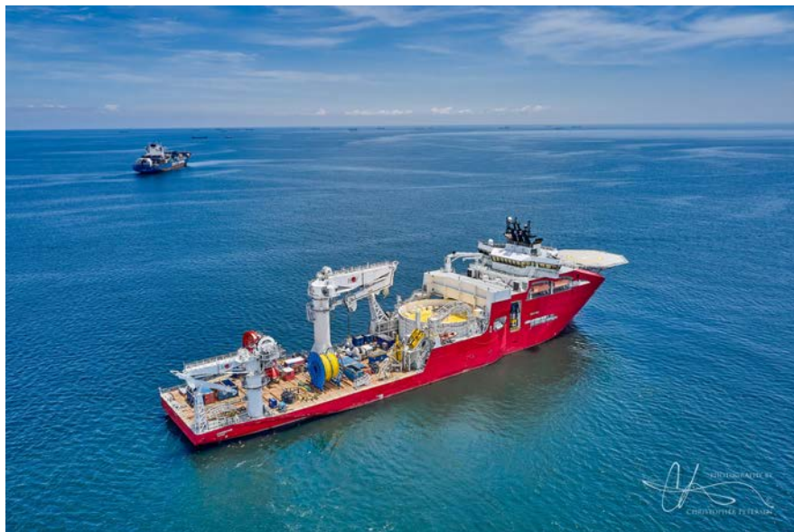
Figure 2-1 : Photo of Connector