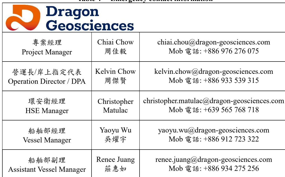
表 4 緊急聯絡資訊 Table 4 Emergency contact information