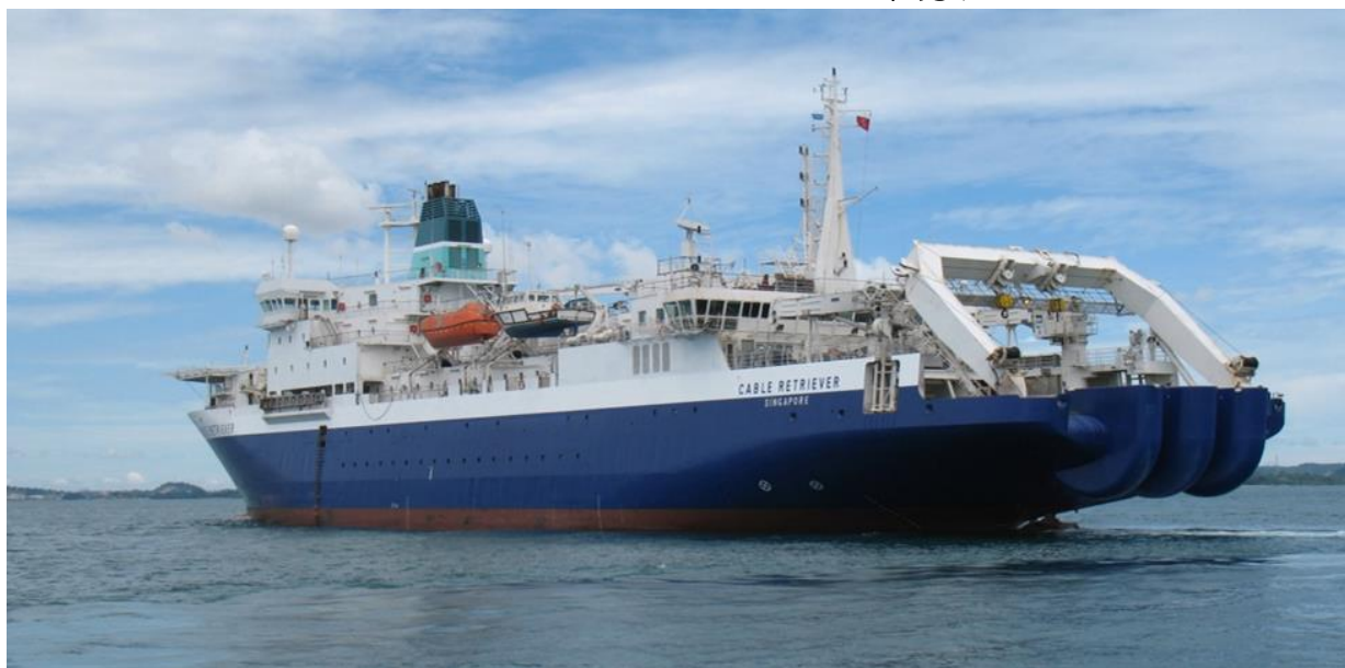
Cable Retriever 海纜船